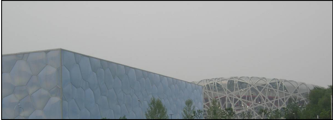
The Water Cube and the Bird's Nest at the Olympic Park

other and in which official Chinese figures report rampant corruption in land and housing confiscations by the Government.