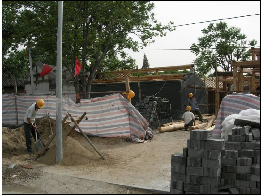
Demolition and reconstruction in Xianyukou

According to residents interviewed, the mediation talks for the first group of households to be evicted were held during the second half of 2005 and were finished by the end of the year. Many of these households were offered approximately 8 020 yuan per m 2 and many rejected this offer, as well.