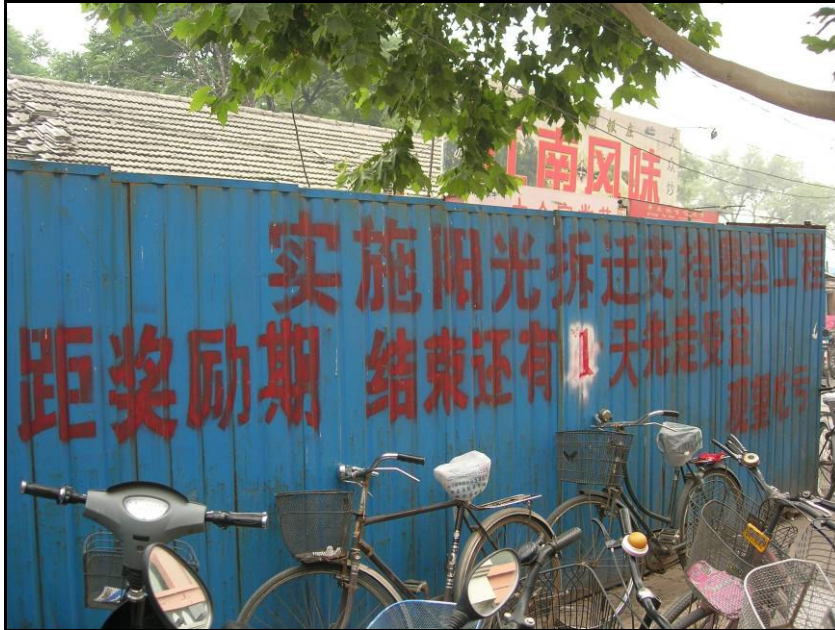
Dayuanfu hutong: text reads “Honestly implement sunshine demolition and support the Olympics Engineering. The reward date is approaching. There is still 1 day until [you can] leave early and receive benefits; wait around and lose out.”