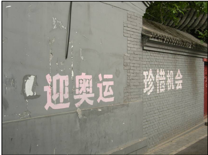
Dongchang hutong: text reads “Welcome the Olympics, Treasure the Opportunity”