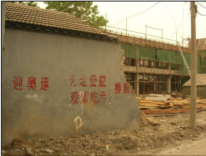
Dayuanfu hutong: text reads “Welcome the Olympics, Leave early receive benefits, Wait around and lose out.”

Following the release of Fair Play for Housing Rights , Chinese authorities stated in December 2007 that only 2 000 people were removed from Olympic Games venues, 7 later revising that figure in February 2008 to 15 000 people. 8 The vast difference between the Chinese authorities' figures and those that COHRE has documented is due to the inclusion of estimates of those displaced due to: