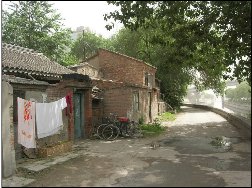
Settlement by the Tonghui River

investors. 55 The Xinhua news service also reported in May 2008 that official figures showed an increase of 67.6 percent in illegal acquisitions of land from 2006. 56