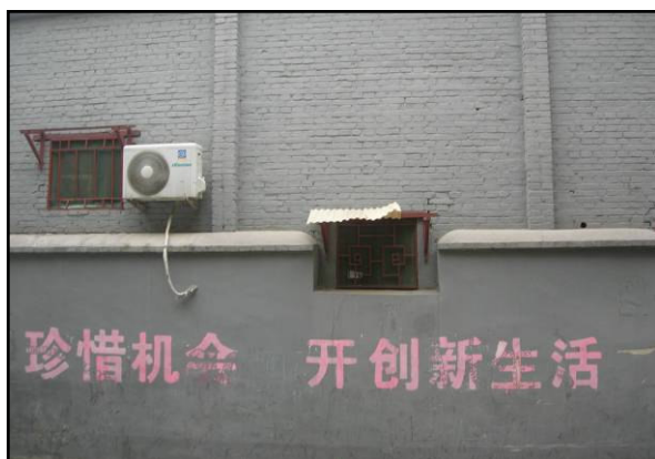
Dongchang hutong: "Treasure the opportunity, Initiate a new life."

There are also evictions scheduled for the Great China Gate East Factory Neighbourhood under a project for the cultural preservation of the area. A resident of the community explained that between one and two thousand people are expected to be affected by the demolitions and will have to move. As far as he understood, the authorities would be selective in what they tear down and will demolish non-history, and/or poorly constructed buildings, but will allow others to stay. They will reconstruct buildings based on the traditional courtyard style housing and will make these available to residents who can afford to pay more than the current owners and renters. Despite the painted slogans on their walls threatening residents to "Welcome the Olympics ... Leave early, receive benefits, wait around and lose out," residents were not aware of the exact date of the evictions, nor the rate at which they would be offered compensation.