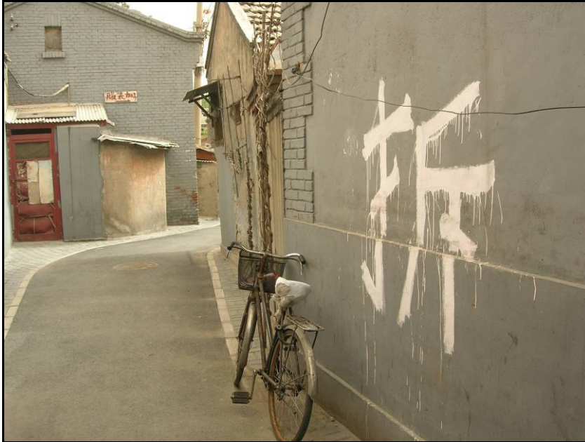
Dongchang hutong: text reads “demolish”