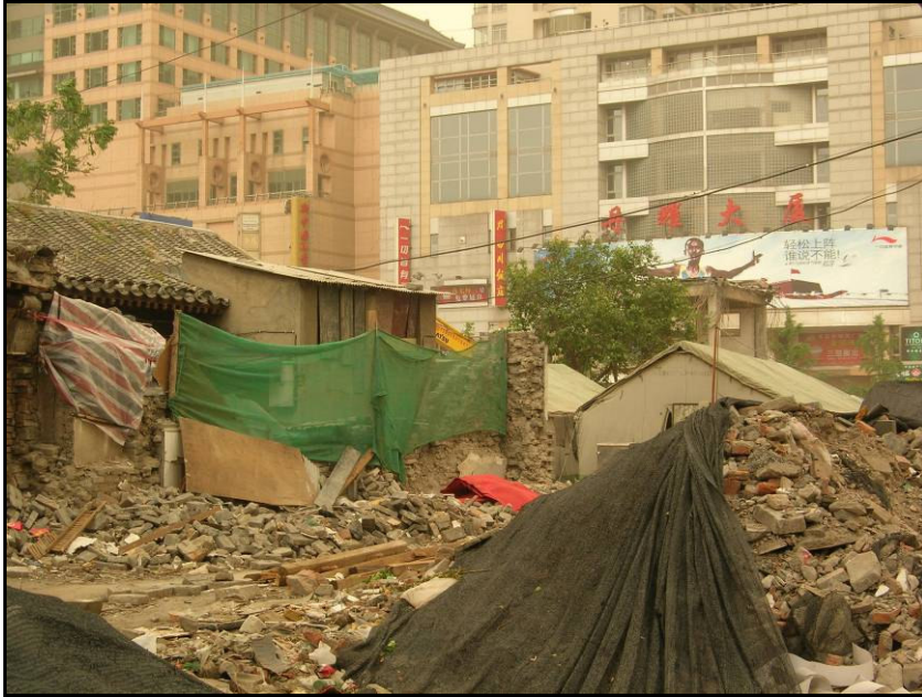
South of Dayuanfu hutong, demolitions near Wangfujing Street.

Regardless of this optimistic perspective, not everyone agrees on the definition of success. A man being interviewed about his eviction from Xianyukou stated: “Average Chinese citizens have no way to protect their rights.”