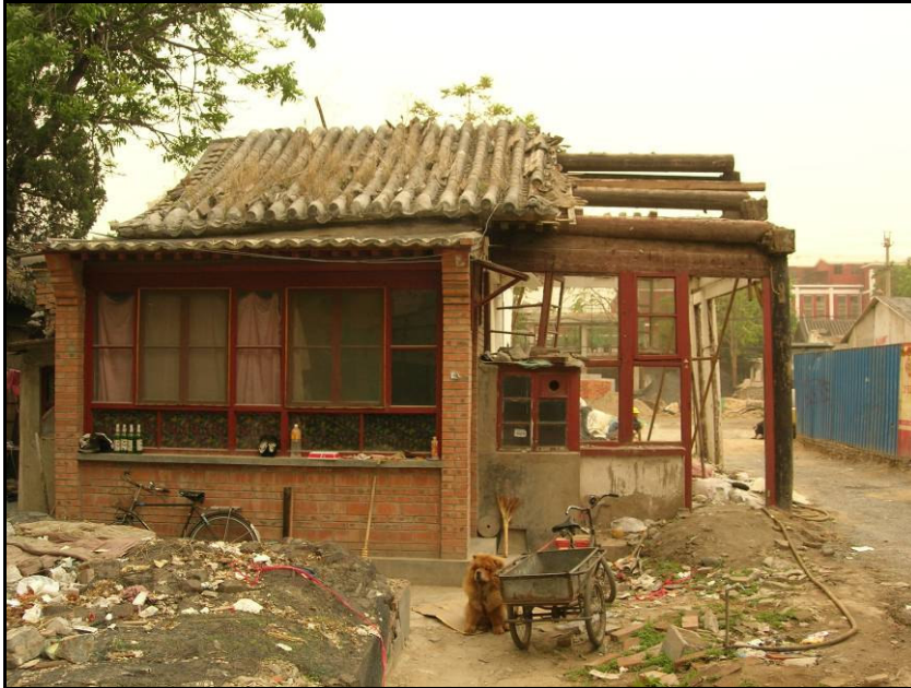
Dayuanfu hutong: traditional housing surviving in the rubble