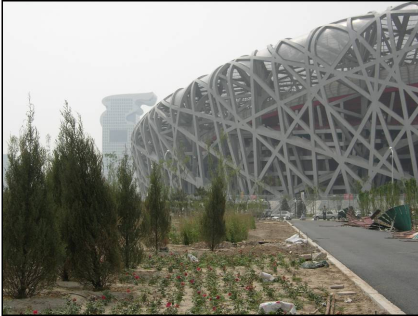
The Bird's Nest