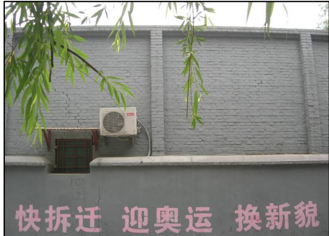
Dongchang hutong: text reads "Demolish quickly, Welcome the Olympics, Switch to a New Look."

In Dongchang hutong, for example, the authorities have painted slogans on the once plain, grey walls of the community, saying, "Welcome the Olympic Games", "Treasure the opportunity", "Improve our surroundings", and "Initiate a new life". The slogans encourage people to accept compensation offers and to leave early by invoking a spirit of cooperation to do what is best for the community rather than the individual, by moving out in order to "improve our surroundings". With the inclusion of the phrase "Welcome the Olympic Games" into this propaganda, authorities pressure residents to work together as a Beijing community to showcase their city and their country to the world, by putting the community's 'welfare' above their own individual rights. However, many residents do not believe that doing what is best for the community and the individual are mutually exclusive and have written their own graffiti on the walls of their homes, protesting unfair compensation rates.